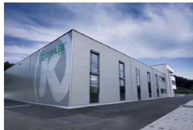
The company's new building with a direct link to the A98 motorway

Instruments from Kohler stand for innovation, quality and precision – the values expressed by the company's new offices. This investment is the family business's response to the successful course of the past 30 years and sets the foundation for economic production, efficient working practices and high performance merchandise management. In excess of 4,000 instruments and countless OEM products for well-known manufacturers in the dental industry are developed, produced and adapted to people's different anatomies at the site in Germany and supplied to over 80 countries worldwide.