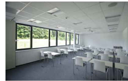
The lounge for guests and staff