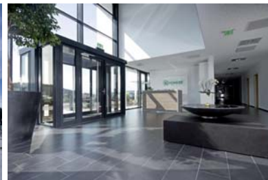
Stainless steel and natural elements determine the design inside and out