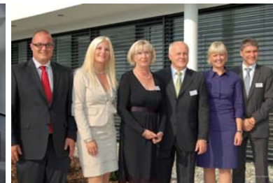
Two generations of the family business stand for success through expertise