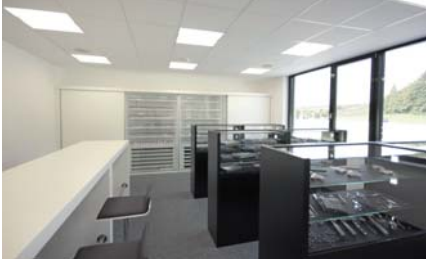
View of finishing with quality control